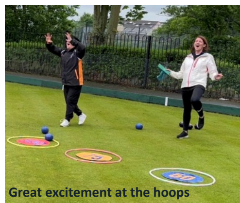
Great excitement at the hoops