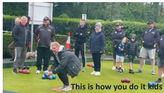
This is how you do it kids