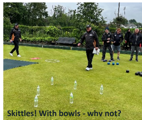
Skittles! With bowls - why not?