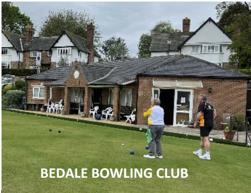
BEDALE BOWLING CLUB

Our Travelling members enjoyed a lovely day at Bedale Bowling Club. The weather was kind, and the hospitality was up to the usual high standard. NHBC retained the shield for the third consecutive year, winning overall by 107-58, 4 rinks to 1. ....Bring on 2025